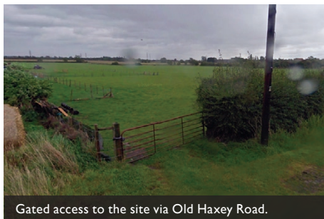
Gated access to the site via Old Haxey Road.

After farmland values increased by 10% in 2010, Savills have forecasted that farmland values could increase by a further 12% in 2011.