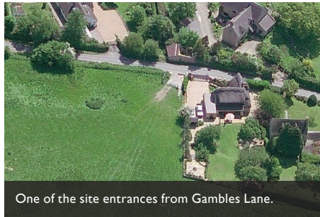
One of the site entrances from Gambles Lane.