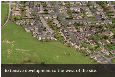
Extensive development to the west of the site.